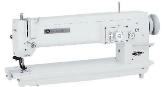
Also available as 30" H-305XL