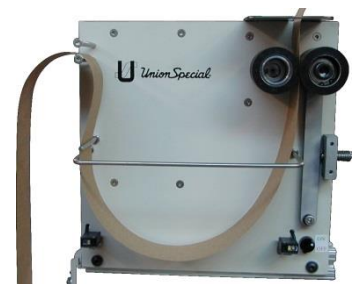
Tape Feeder Option