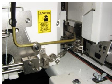
Needle Cooler Option